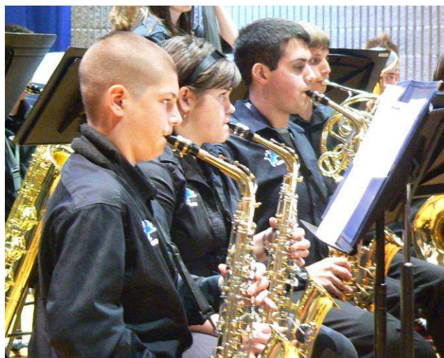
The Kate Andrews High School Band and Choir recently returned from a highly successful tour of