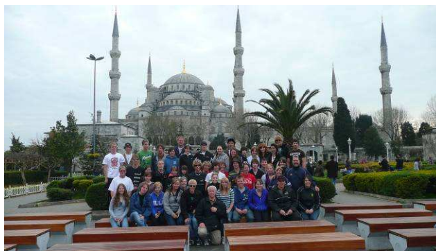
Istanbul – The Blue Mosque

Without question, travelers gained life experiences they found enriching and positive. Besides the wondrous new sights, and endless meals aboard the ship, the excursion provided an opportunity to immerse (however briefly) in a very different culture, and come to appreciate it more fully. Chaperones have expressed their thanks at the positive and cooperative nature of our student travelers, and the new friendships established between schools. Next year ... the Nile????