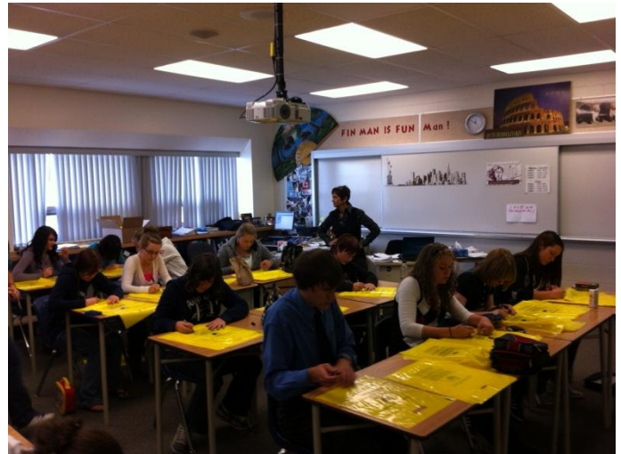
LEO Club members prepare bags for annual food drive to benefit the Coaldale Food Bank.