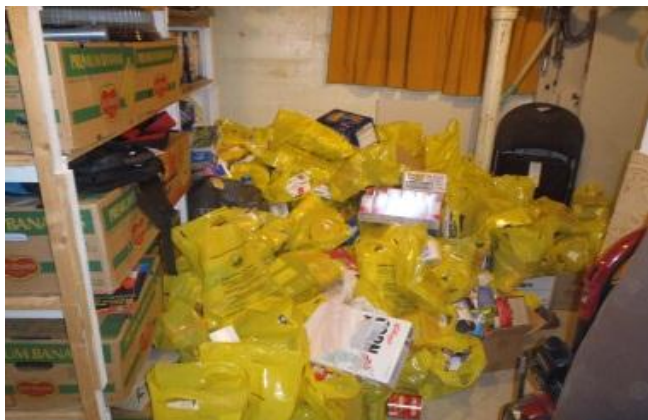
Some of the goods collected

On October 21 st Kate Andrew's staff and students conducted a food drive throughout the Town of Coaldale. A total of 640 bags were collected equaling a dollar value of $5,473.00 which is $2,016.00 more than we collected in 2010-2011. Thank you to the entire community for the tremendous support and to the students, staff and parents who volunteered to help with this annual event.