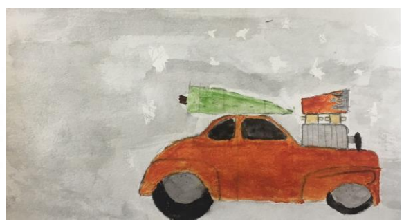
Zoltan Bezooyen, Art 10