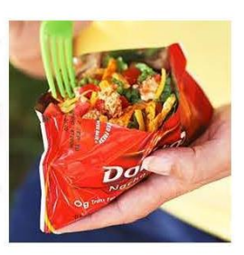
Weds. Feb. 6<sup>th</sup> Hamburger, pop/water & bag of chips