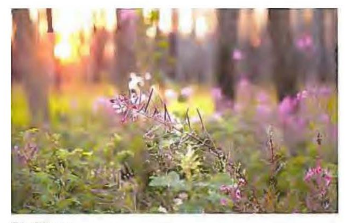
Resilience: Fireweed, August 2016 Photography on Hahnemühle Fine Art Baryta Collection of the artist