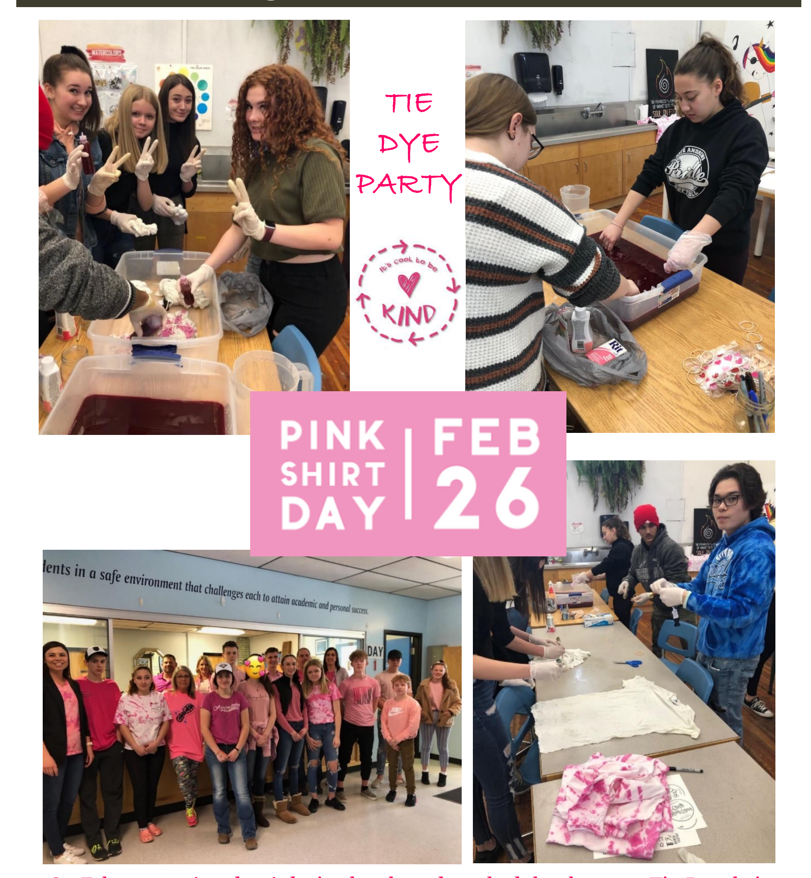
On February 24<sup>th</sup> and 25<sup>th</sup> during lunch students had the chance to Tie-Dye their own white shirts for Pink Shirt Day. Pink Shirt Day aims to raise awareness of bullying prevention and highlight where to turn if in need of help.